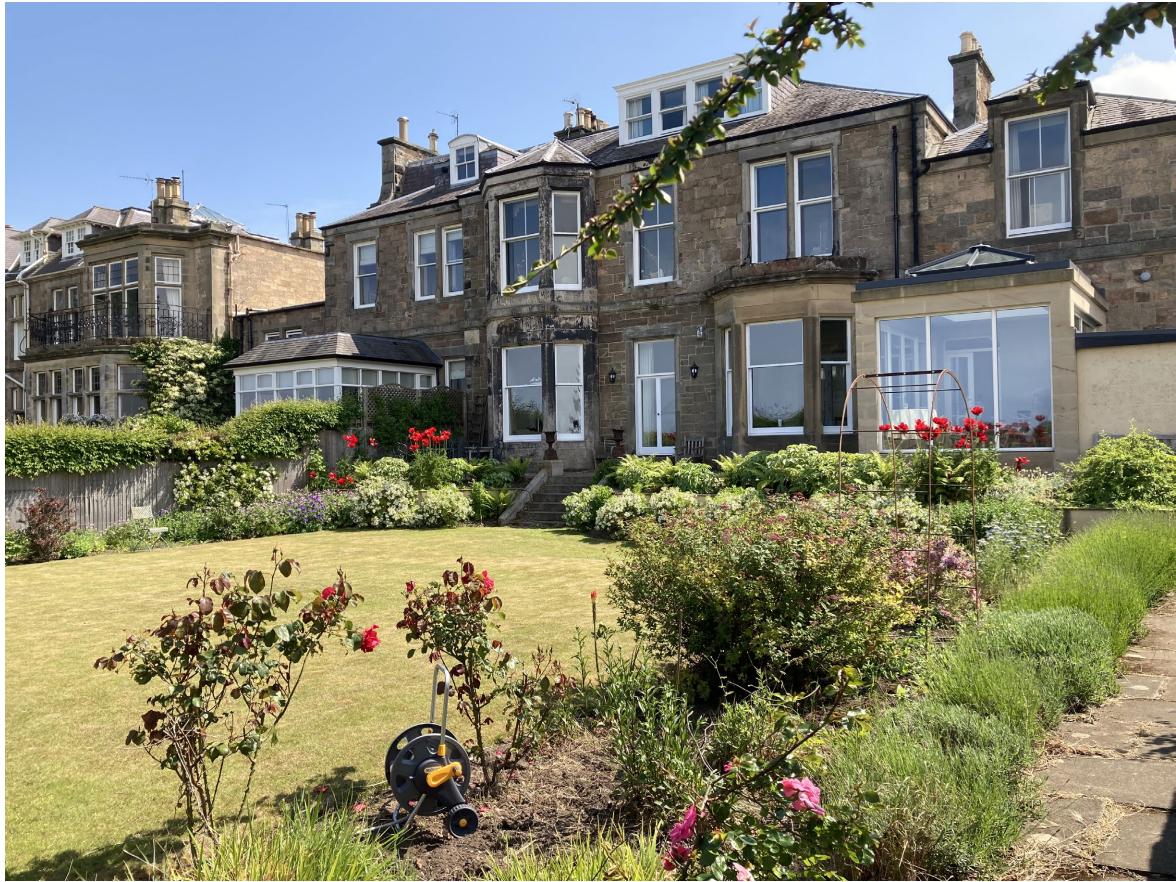
Private front garden of 10 Cromwell dividing fence visible on left