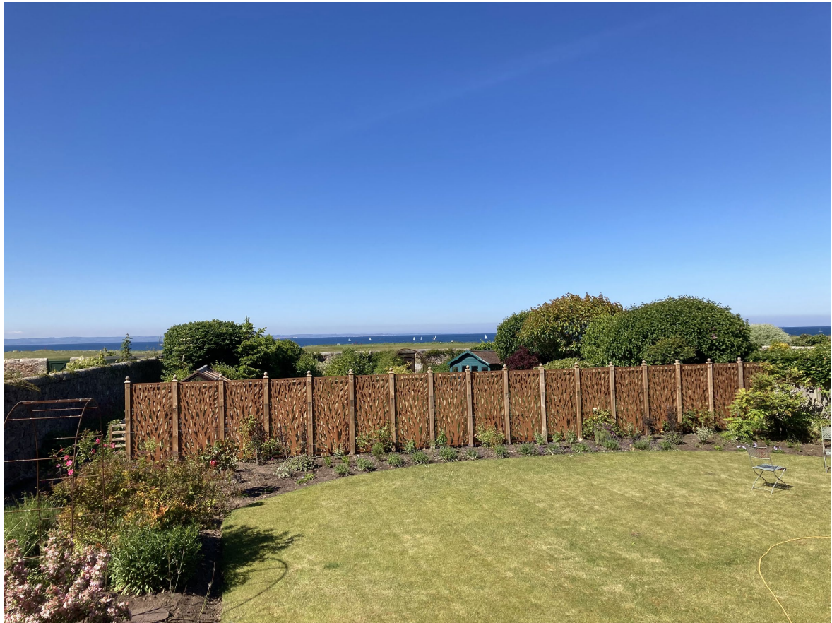
Fence with bamboo screening to obscure garden at no 12