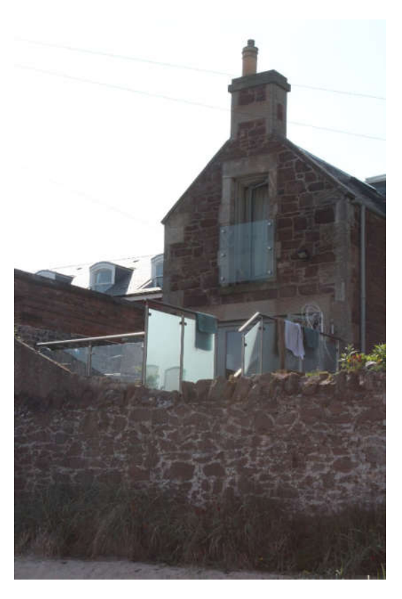
9. Glass balustrade seen from West Beach