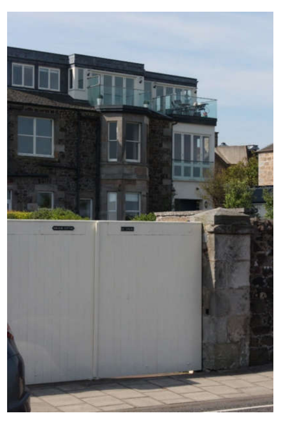
7. Glass balustrade seen from Beach Road