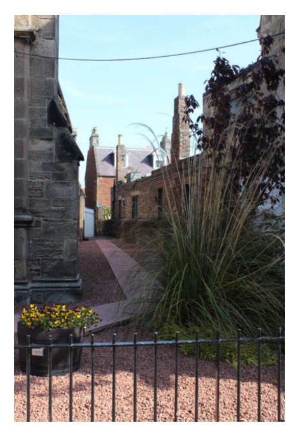
4. 59 Forth Street viewed from High Street