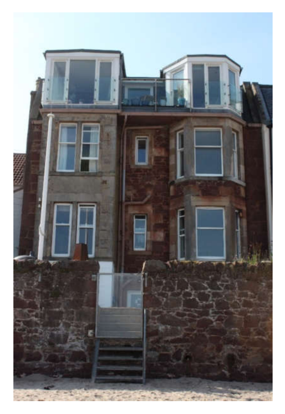
8. Glass Balustrade seen from West Beach