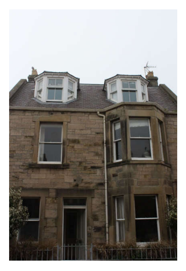
1. 59 Forth Street viewed from street level