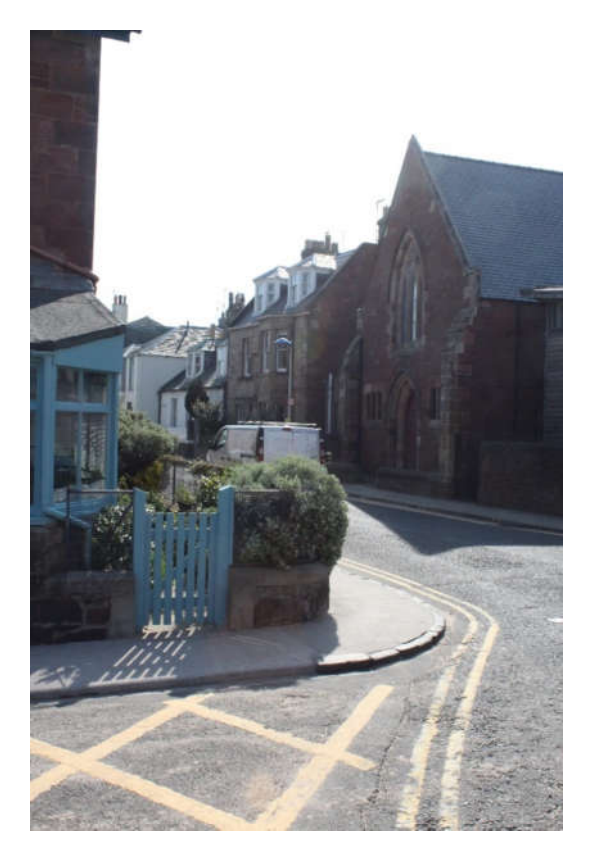
3. 59 Forth Street viewed from Beach Road