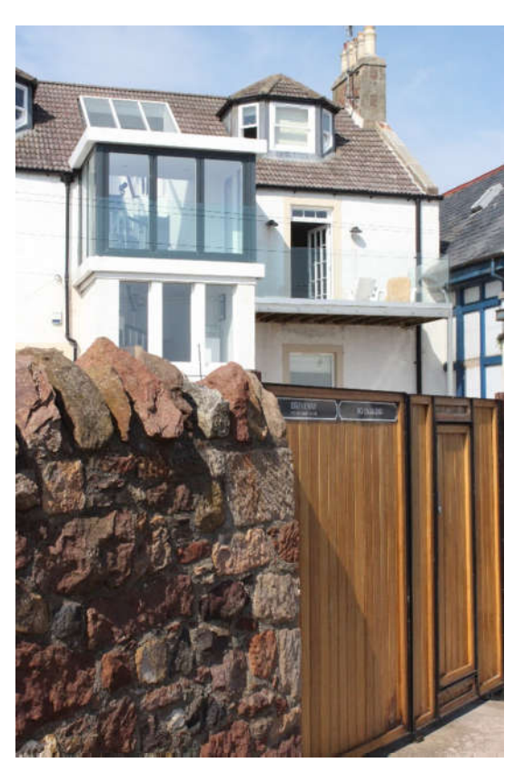
10 Glass balustrade seen from Melbourne Rd