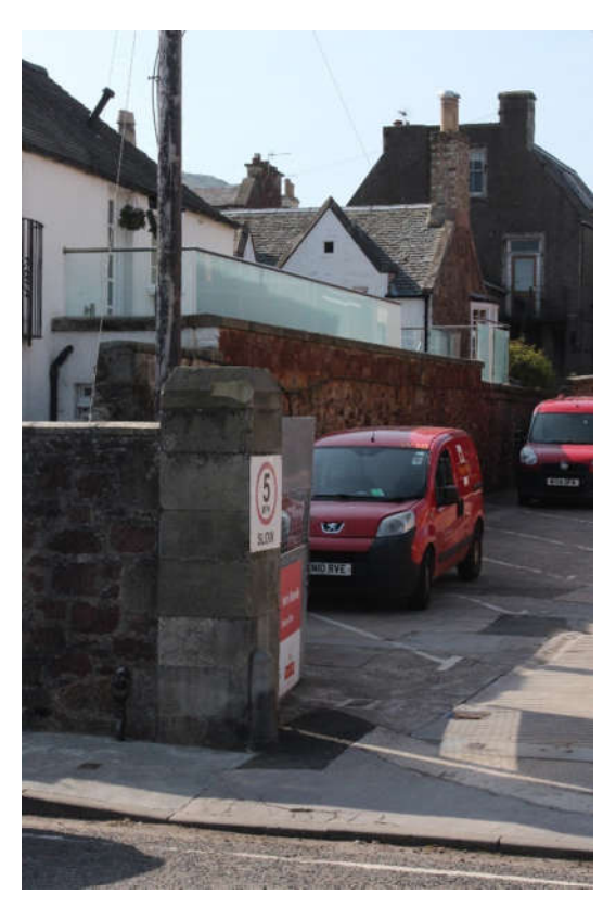
5. Glass balustrade seen from Beach Road