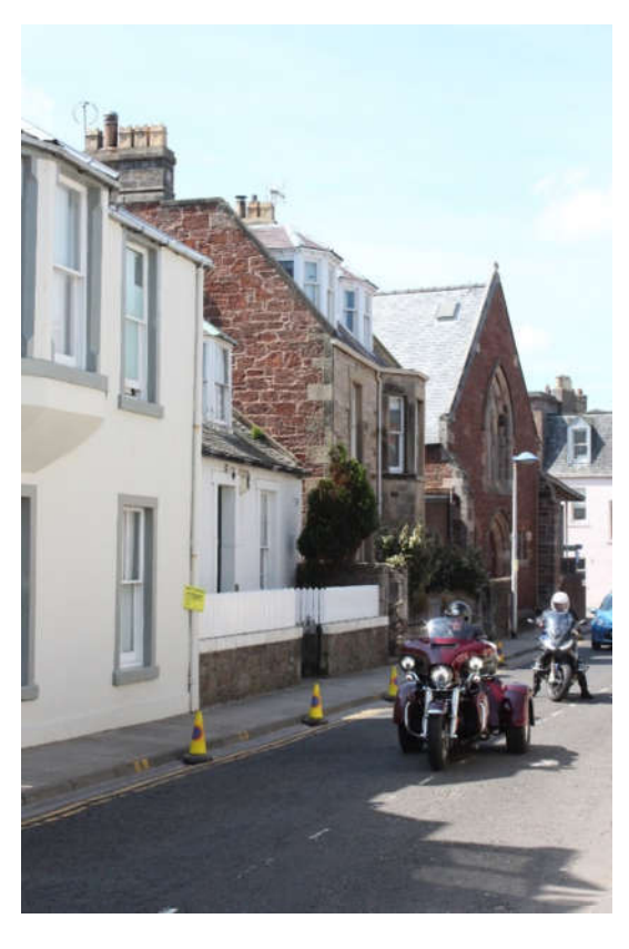
2. 59 Forth Street viewed from Forth Street