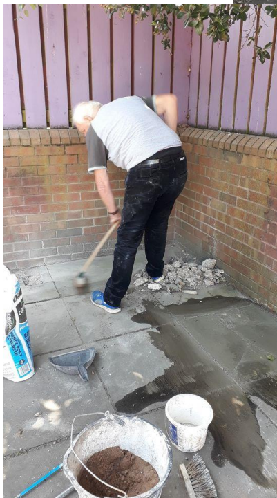
The removal and erection of the benches at Cherry Tree's Dunbar