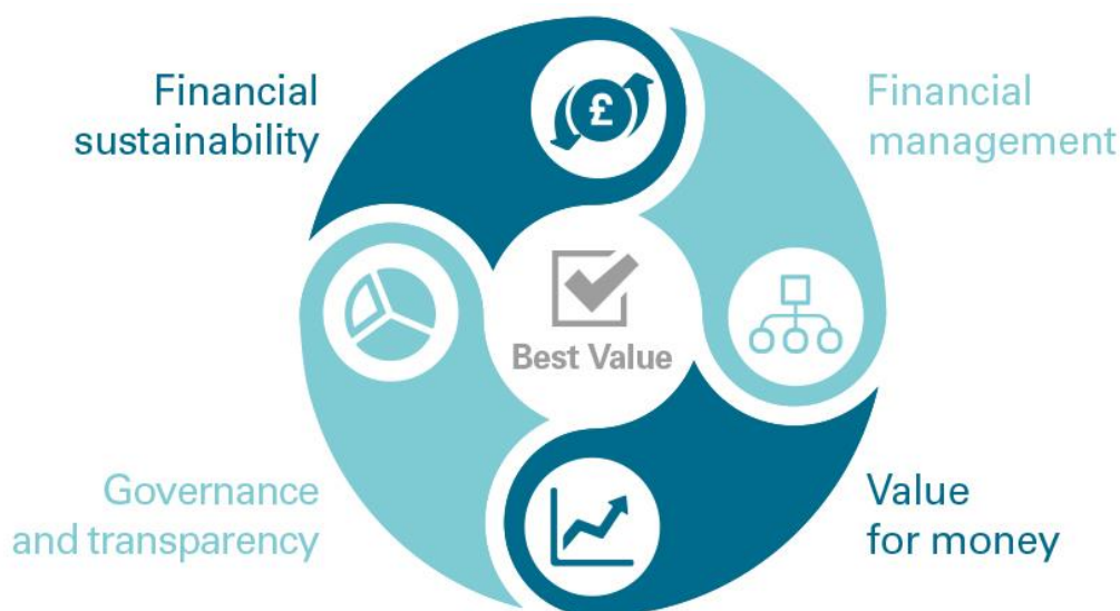
Exhibit 1 Audit dimensions