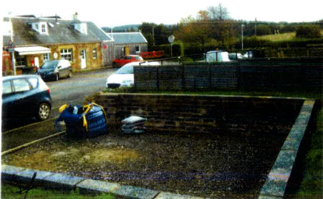
THE HUB + PROPOSED DRIVEWAY AT 8 COUNCIL HOUSES + EXTENSION ARROW TO ALLOW FOR TURNING