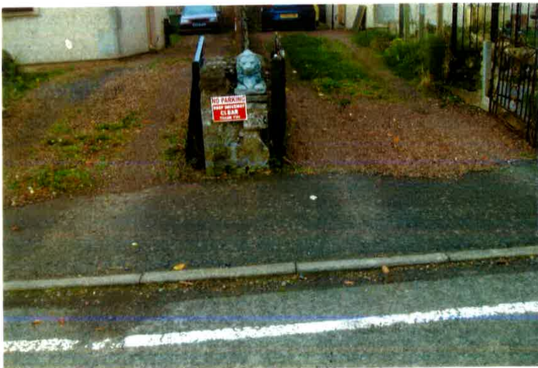
7 and 6 COUNCIL HOUSES - DRIVE WAY