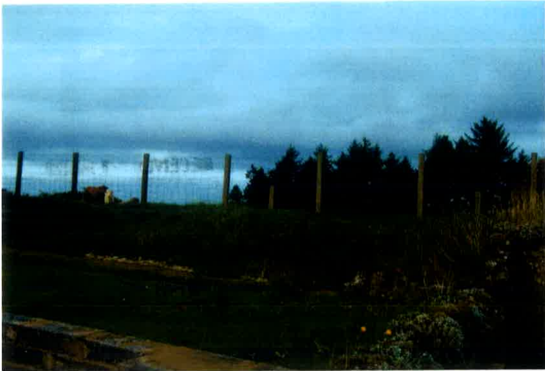
FIELD NEXT TO NO. 8 COUNCIL HOUSES AND PATH TO HOUSE