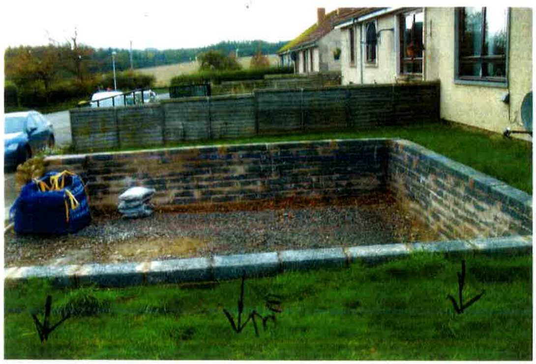
PROPOSED DRIVE - SIDE VIEW - FROM PATHWAY AT 8 COUNCIL HOUSES PROPOSED PRE PLANNING, THIS IS GOING TO BE EXTENDED AS REQUIRED TO ALLOW FOR TURNING