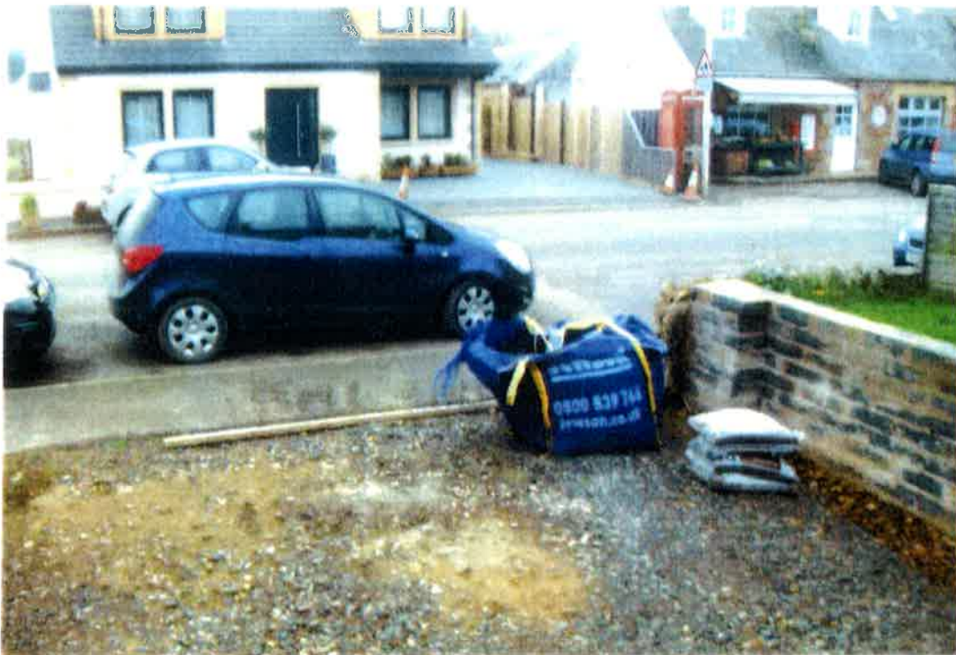
THE HUB + NEIGHBOURS + PROPOSED DRIVEWAY AT 8 COUNCIL HOUSES.