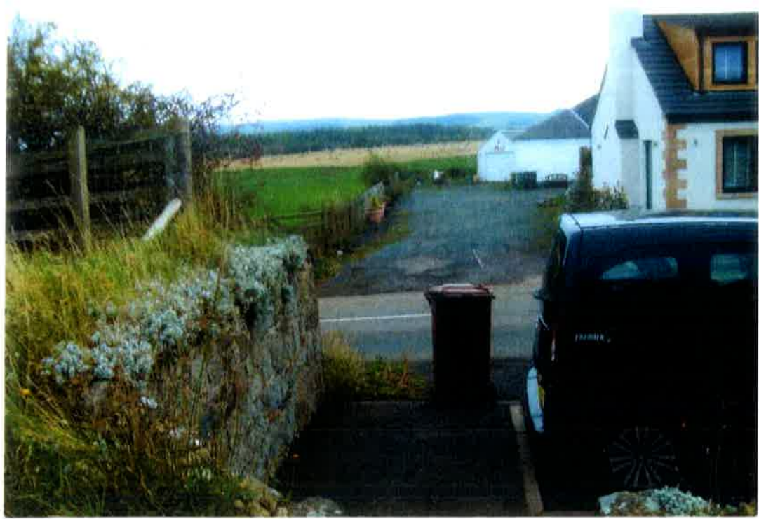
VIEW FROM 8 COUNCIL HOUSES GATE - NEIGHBOUR'S DRIVE