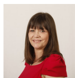
Deputy Convener Clare Haughey Scottish National Party