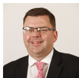
Colin Smyth Scottish Labour