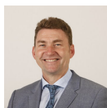
Brian Whittle Scottish Conservative and Unionist Party