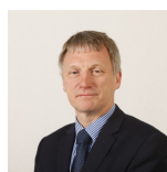
Ivan McKee Scottish National Party