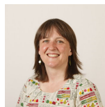
Maree Todd Scottish National Party