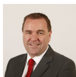
Convener Neil Findlay Scottish Labour