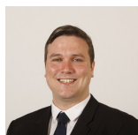
Tom Arthur Scottish National Party