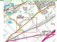
Tree Preservation Order No 136 (2016) plan. Not to scale.