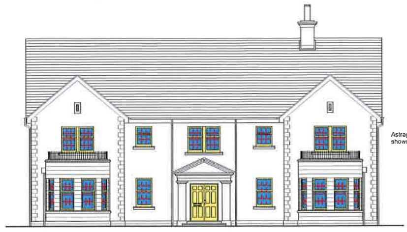
West Elevation As Proposed

Finishes Windows & Doors: White uPVC lilt and turn sash and case look a like window and White uPVC doors in place of Dark Oak timber with astragals. Design changes to the house as changes to the scheme of development the subject of planning permission 14/00566/P and varied by planning permission 15/00684/P