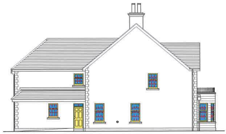
North Elevation As Proposed