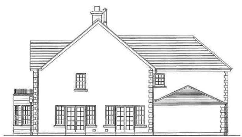
South Elevation As Approved