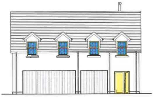
Garage North Elevation As Proposed