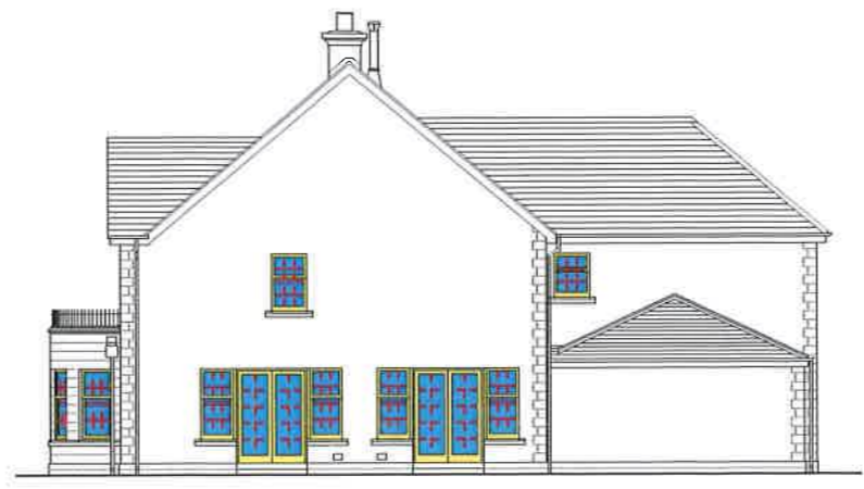
South Elevation As Proposed

Revisions P0 17/12/15 Planning P1 14/03/16 Fix transom heights, Amend window description, Renumber drawing, Planning A 21/03/16 Add Yellow highlighting to doors and windows.