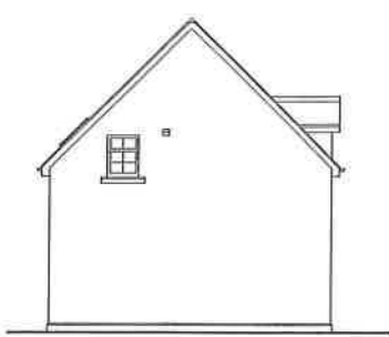
Garage East Elevation As Approved