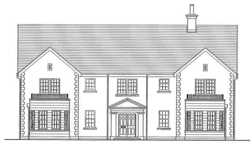
West Elevation As Approved

Design changes to the house as changes to the scheme of development the subject of planning permission 14/00586/P and varied by planning permission 15/00684/P