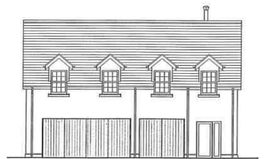
Garage North Elevation As Approved