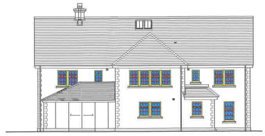
East Elevation As Proposed