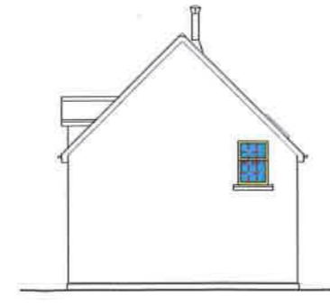
Garage West Elevation As Proposed