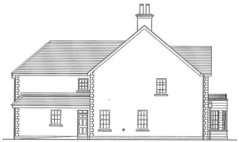
North Elevation As Approved