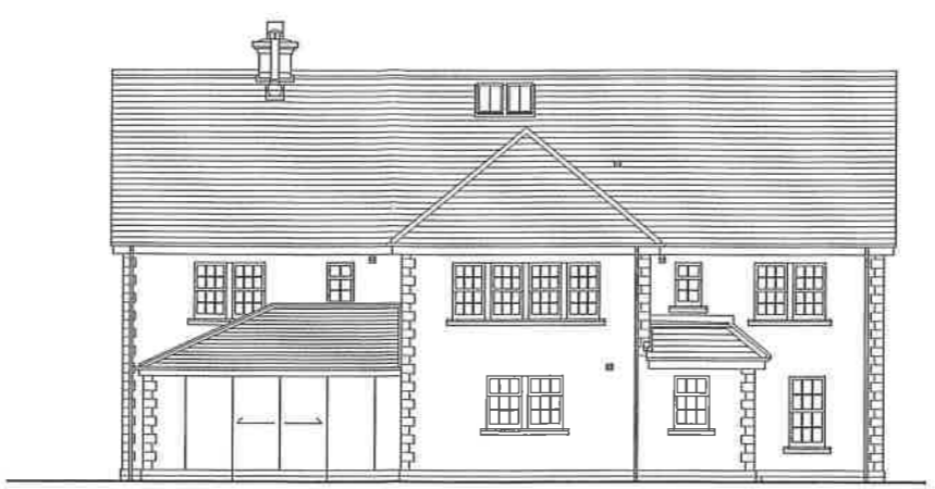
East Elevation As Approved