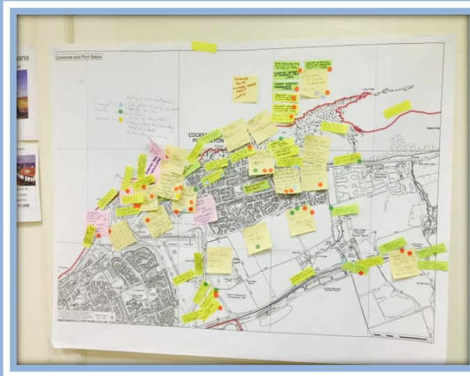
Cockenzie and Port Seton