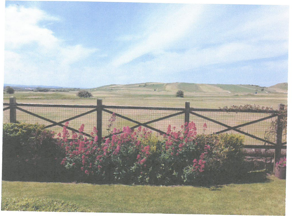
PHOTO 1 LOOKING FROM OUR DOOR TO THE WEST AND OUR OPEN-NESS TO THE PREVAILING ELEMENTS