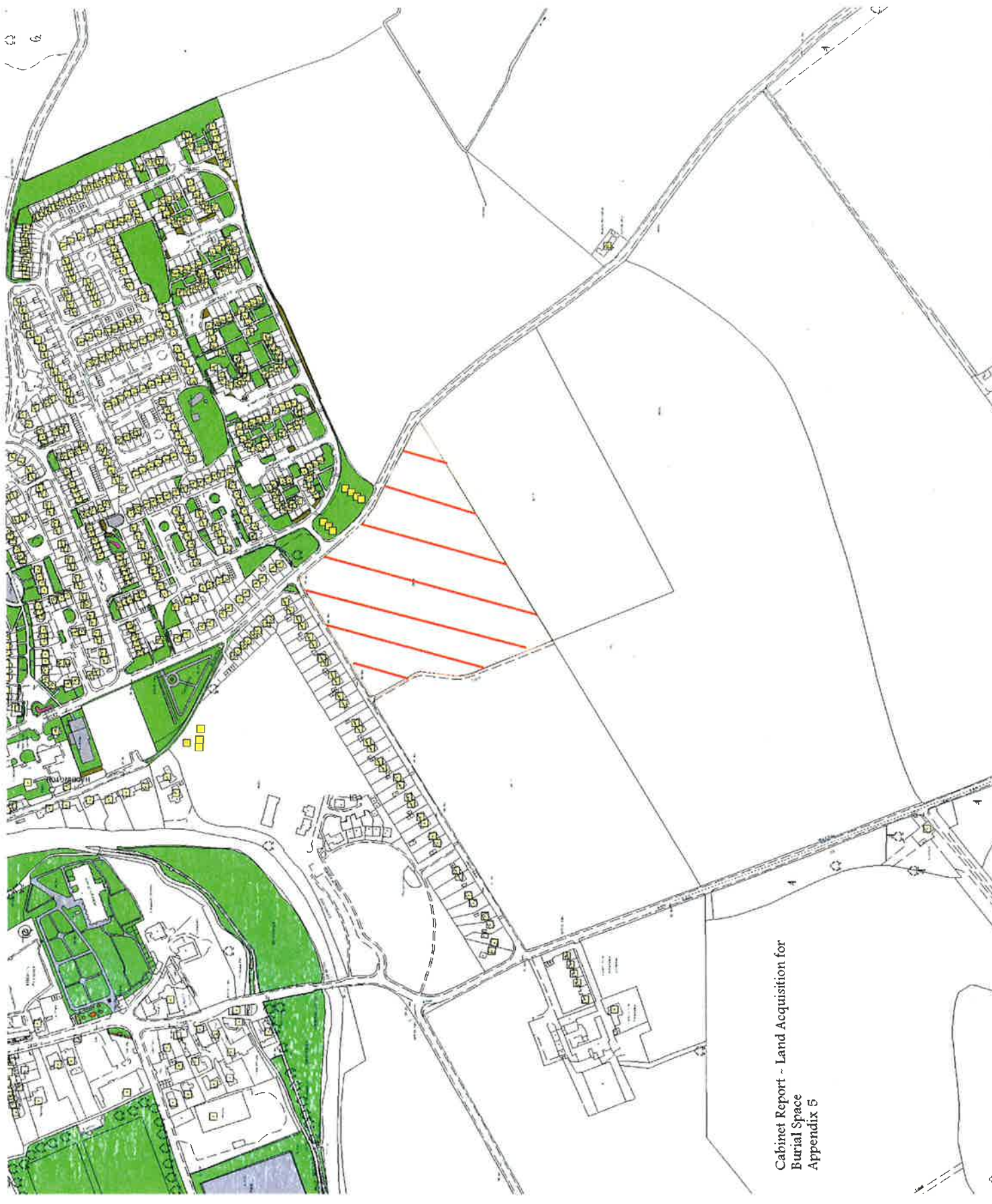
Cabinet Report - Land Acquisition for Burial Space Appendix 5