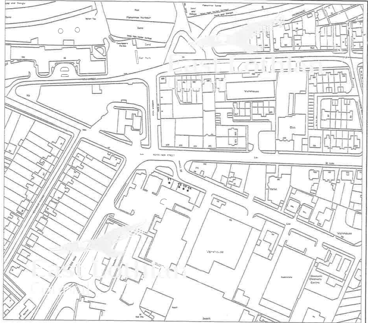
Location Plan Scale 1:2500 (at A4 size)