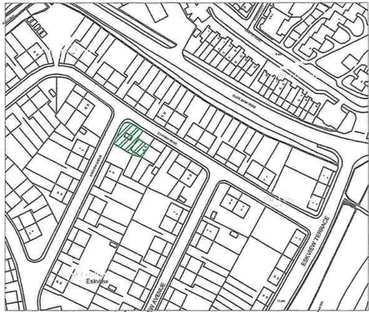
Location Plan Scale 1:2500