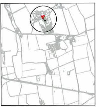
LOCATION PLAN Scale 1:50000@A4