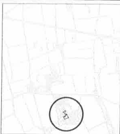
LOCATION PLAN Scale 1:50000@A4