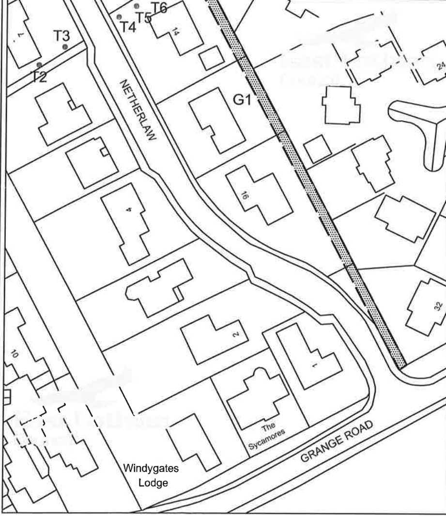
Scale 1:1000 (at A4 size)