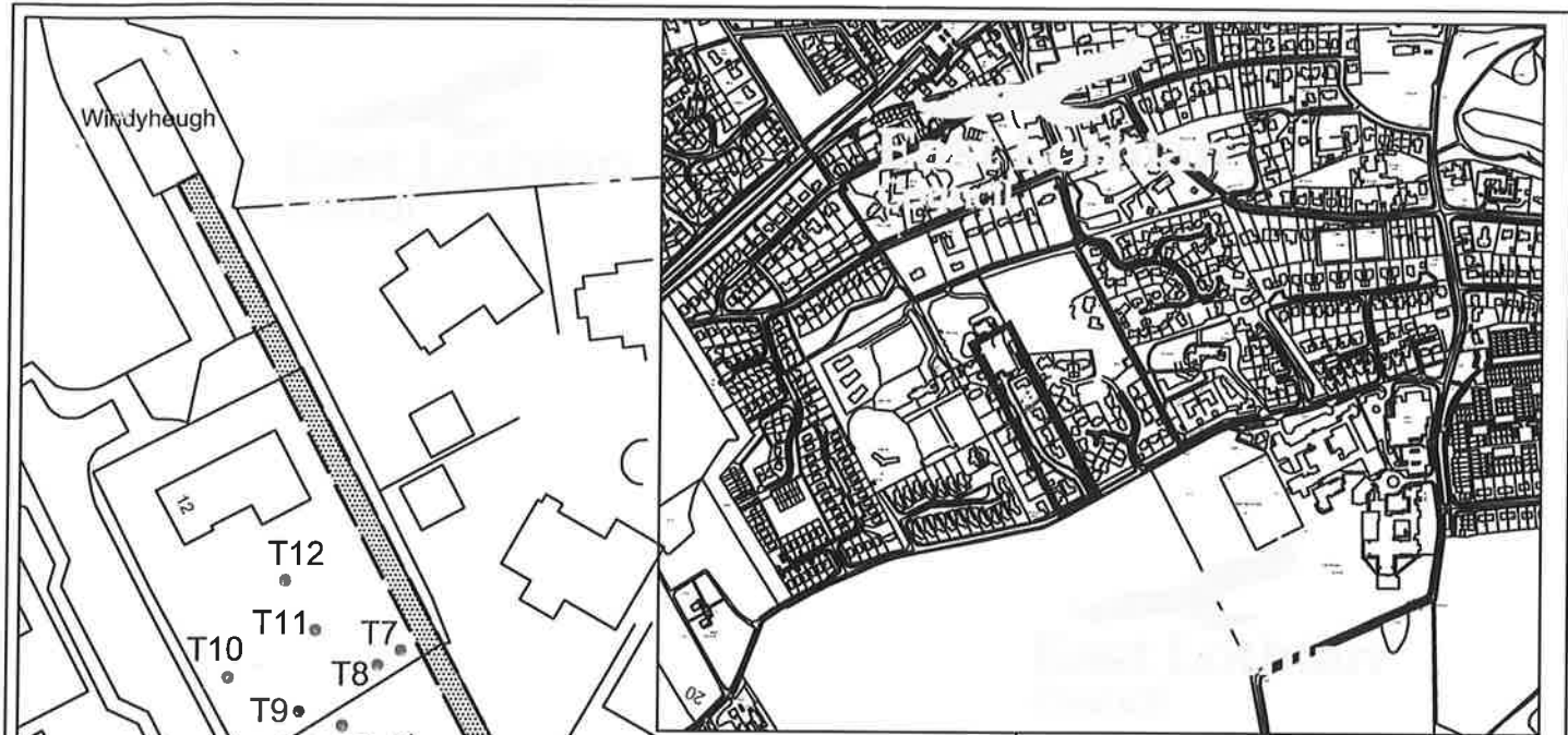
Location Plan Scale 1:10000 (at A4 size)