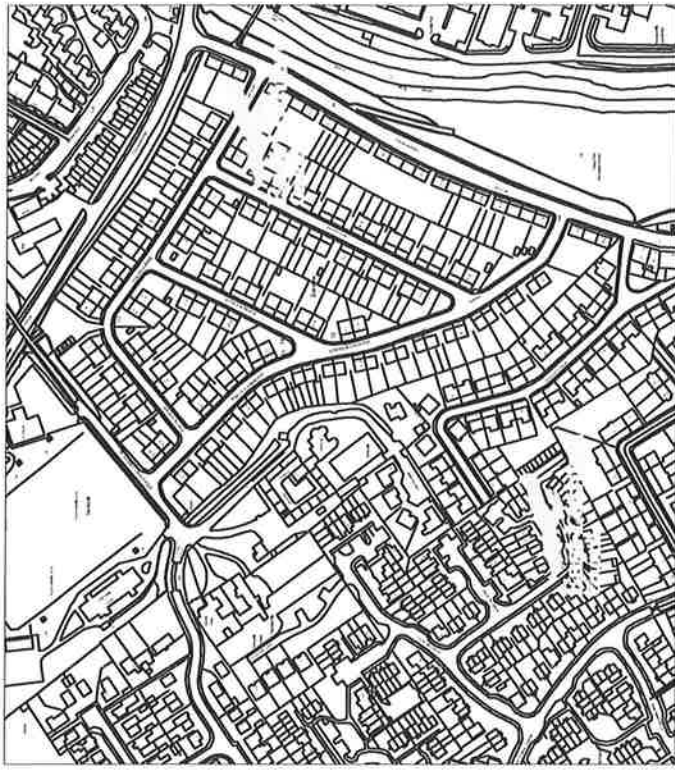
LOCATION PLAN Scale 1:5000@A4

This base plan is reproduced from Ordnance Survey material with the permission of Ordnance Survey on behalf of the Controller of Her Majesty's Stationery Office. Crown Copyright 2008. Unauthorised reproduction infringes Crown Copyright and may lead to prosecution or civil proceedings. East Lothian Council LA 100023381 2008