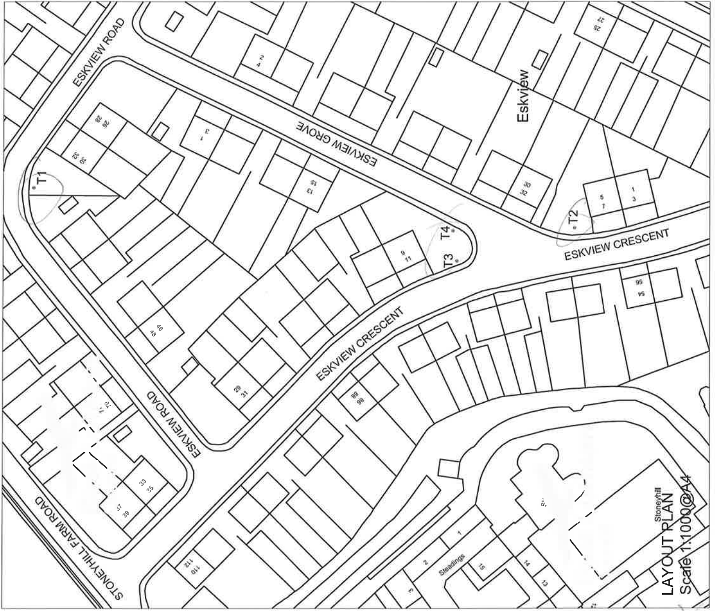
Stonehill LAYOUT PLAN Scale 1:1000@A4